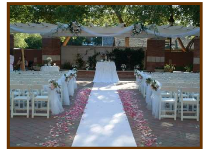
Fountain Terrace (fountain view)