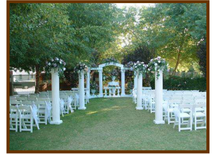
Fountain Terrace (lawn view)

A 5% Service Charge and Applicable Sales Tax apply to all event space rental prices.