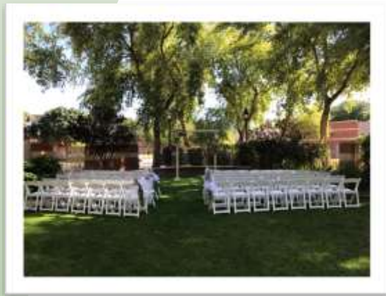
Fountain Terrace (Lawn View)