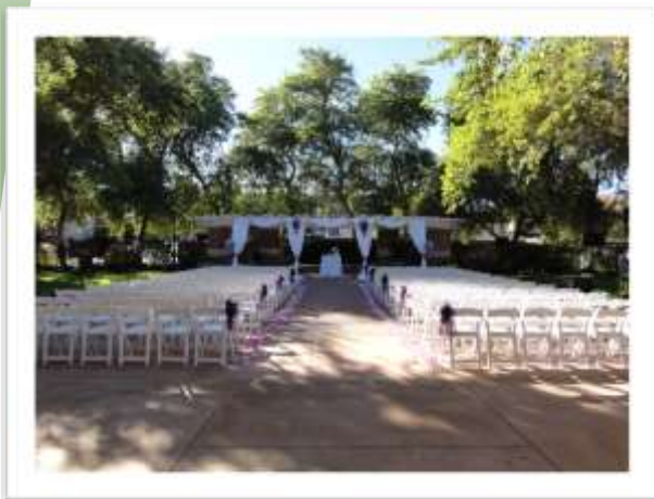
Fountain Terrace (Fountain View)